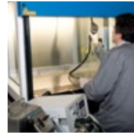
NOISE LEVEL TEST