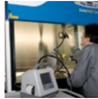
FILTER LEAKAGE TEST