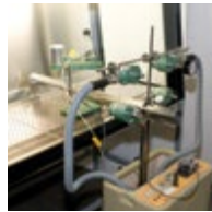
KI DISCUSS TEST