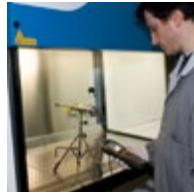
AIR FLOW SPEED TEST

Vertical and horizontal laminar flow cabinets are tested in accordance to ISO 14644-1 and EN-61010:2001 Standards and released with FAT certificate of the tests performed.